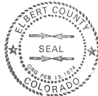
Clerk to the Board of County Commissioners