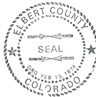
Clerk to the Board of County Commissioners