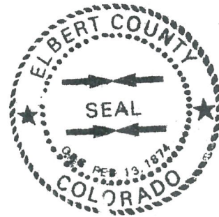
Clerk to the Board of County Commissioners