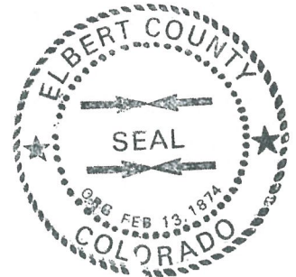
Clerk to the Board of County Commissioners