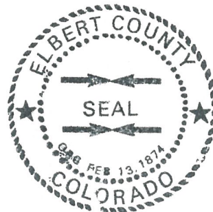
Clerk to the Board of County Commissioners